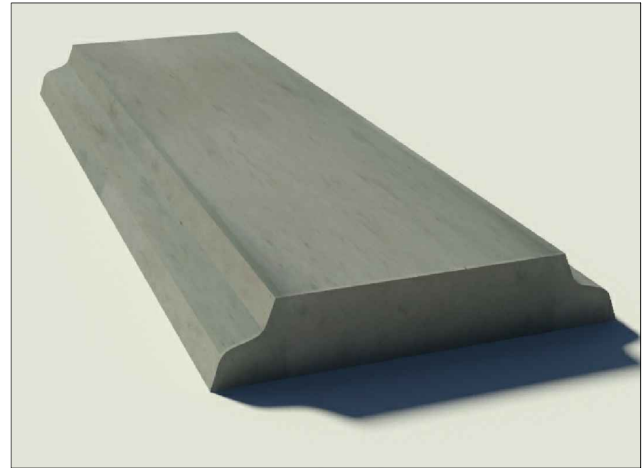
Perspective View 3D