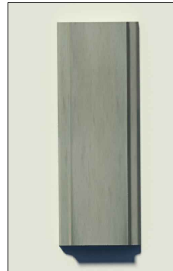
Top View 3D