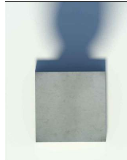
Top View 3D