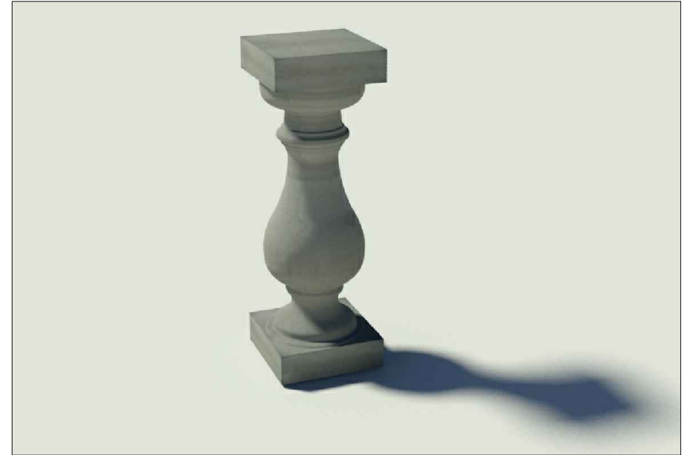
Perspective View 3D